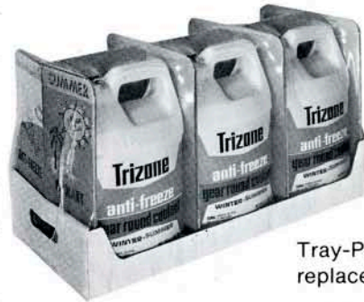
Tray-Pak for anti-freeze replaces shipping carton