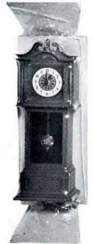
'U' Pad protects clocks and eliminates dunnage materials