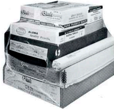
Pick 'N' Pack for stationery replaces master carton

Pictured below are just a few successful 1205 applications.