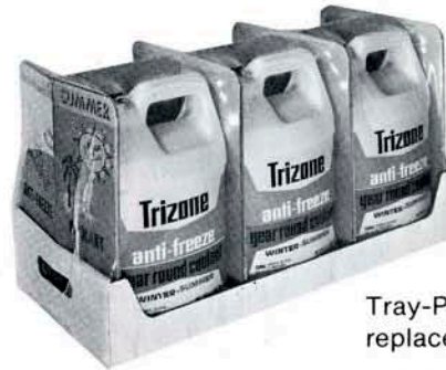
Tray-Pak for anti-freeze replaces shipping carton