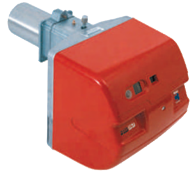
Model RS 28 - 50