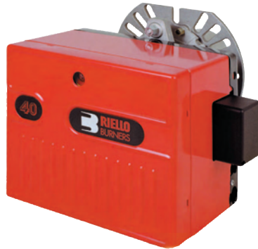
Model G400 - G900

Models G & RS Flame retention burner for gas firing