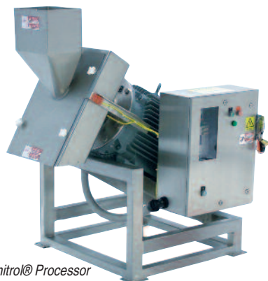
Comitrol® Processor Model 3640 Slant