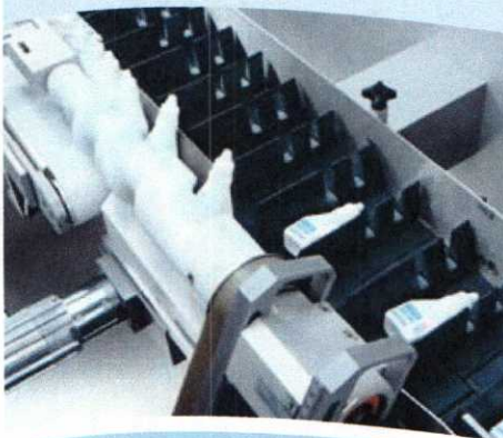
Feeding auger for bottles