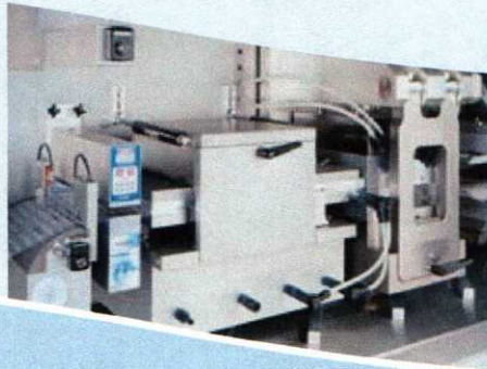
Forming station and index with integrated cooling