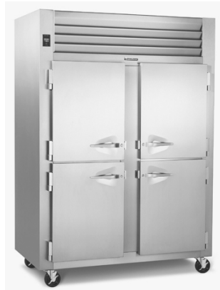
Model RLT232WUT-HHS (shown with optional casters)