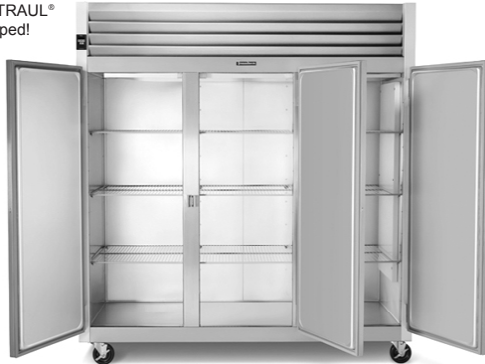
Model AHT332NUT-FHS (shown with optional casters)