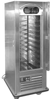
Full Length Door Model RAC37-FHS