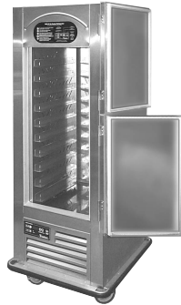
Half Length Door Model RAC37-HHS