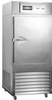
Model RBC100 (shown with optional casters)

Like all blast chillers, Traulsen's model RBC100 is designed to quickly cool its respective capacity of hot product through the HACCP danger zone as fast, or faster, than any other equivalent brand on the market (approximately 90-minutes). However, in addition to the outstanding cabinet construction synonymous with Traulsen, what differentiates these models from competition is the operational flexibility and labor savings inherent in their easy-to-use controls, automatic HACCP documentation, and a variety of operator friendly features, such as our exclusive "By-Product" chill mode.