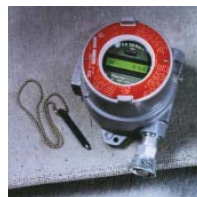
FX-SMT (LEL) (Combustible)