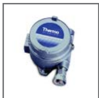
Standard Diffusion Transmitter