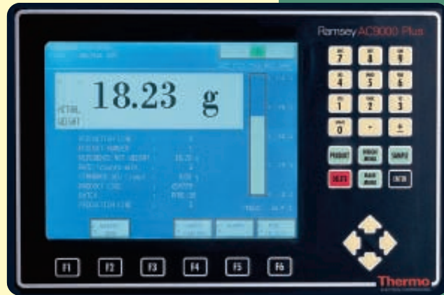
Ramsey AC9000-plus Controller

Some of the standard features of the Ramsey AC4000i include 15 product setup memory, basic production statistics and three/five weight zone operation. Options available to increase the capability of the controller include reject verification, servo feedback and Ethernet communications. With thousands of units installed, the Ramsey AC4000i is a perfect compliment to the Ramsey GP-Series checkweighers, and time-tested solution for general purpose checkweighing applications.