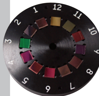
Maintenance-free, optical filter wheel technology