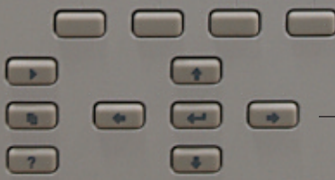
Programmable soft keys