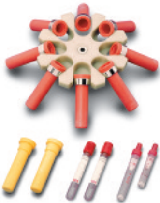
Swinging Bucket Rotor