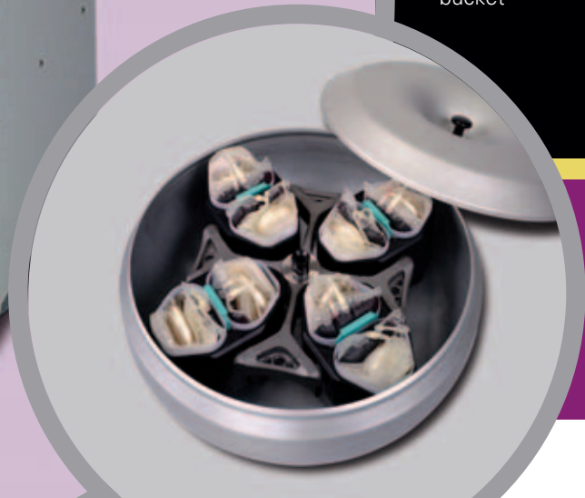
LH-4000W rotor with double blood bag buckets