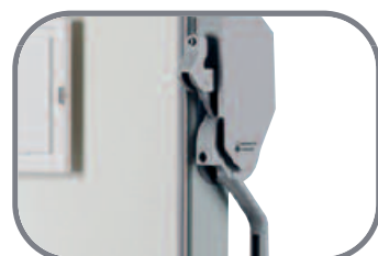
Cryolatch™: integrated door handle and latch for one-hand operation; built-in key lock and padlock compatible