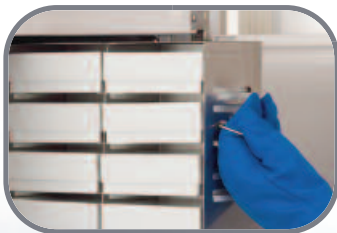
Inventory Racks: optional stainless steel with fiberboard boxes and dividers for complete sample protection