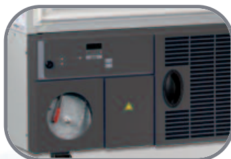
Easy-to-Use Microprocessor Controls: programmable temperature/alarm set points and on-board diagnostics