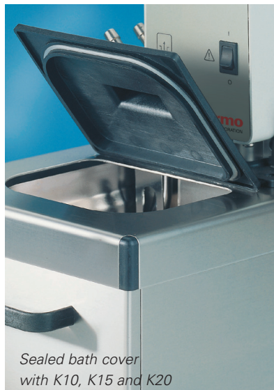
Sealed bath cover with K10, K15 and K20

The units K10, K15 and K20 can be combined with all circulator heads from C10 to DC50.