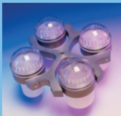
002360F Aerocarrier Rotor with optional Aerocarrier inserts pictured

* Order 3 pair of 011060F adapters and 1 pk/ 12 006680F cushions for 15 mL conical tubes.