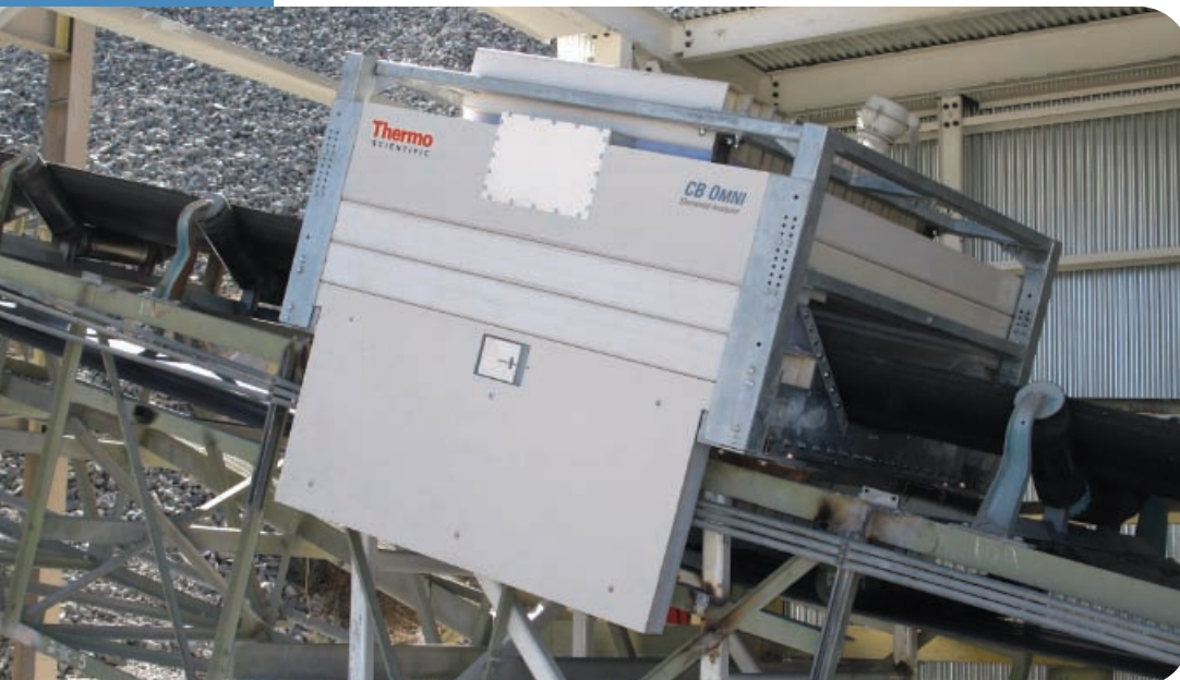
CB Omni CrossBelt online elemental analyzer