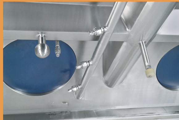
Clean-in-place system contained in cover