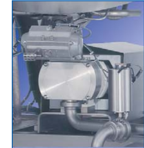
Recirculating / discharge pump