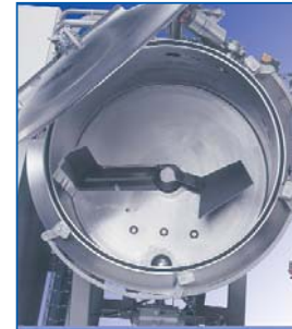
Vessel with mixing arm and steam nozzles