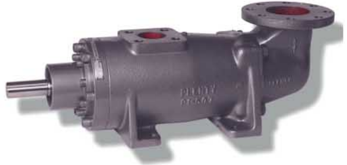
Ductile Iron 6300 with Flanged Ported Case

C6000 Series pumps are designed principally to handle clean lubricating liquids within the viscosity range of 33 to 15,000 SSU. The C6000 is part of the TRIRO family of pumps which include the T, J, E and H series.