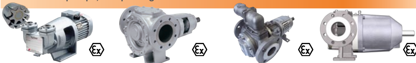
TopGear TG L for low viscosity liquids