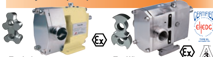
TopLobe hygienic tri-lobe rotors