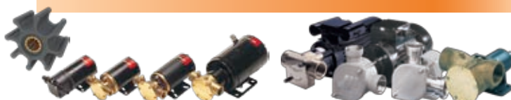
F-19 12/24V DC self-priming extra heavy duty bronze pumps