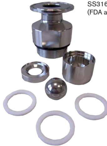
Clamp-connection and ball valve in SS316L with Ra <0.8, PTFE gaskets (FDA approved)