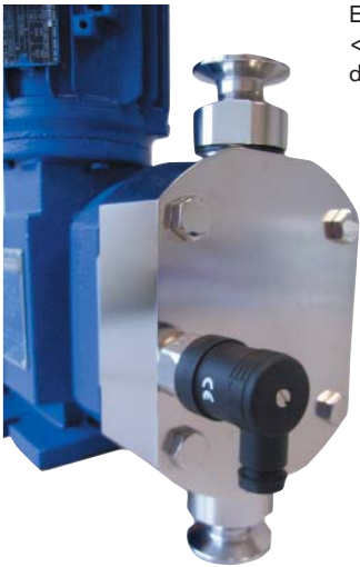
Electropolished pumphead Ra <0.8 with pressure switch for diaphragm monitoring service