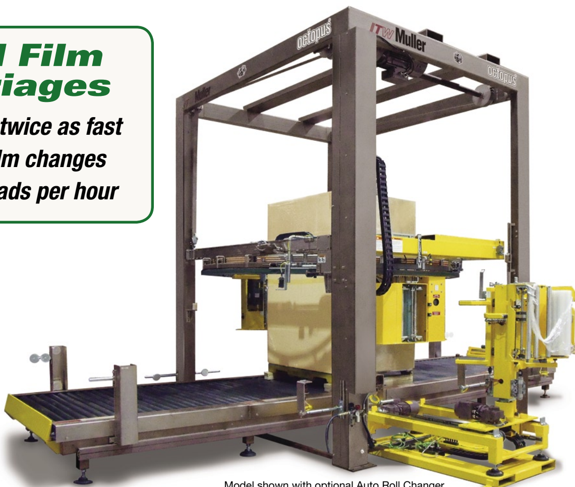
Model shown with optional Auto Roll Changer