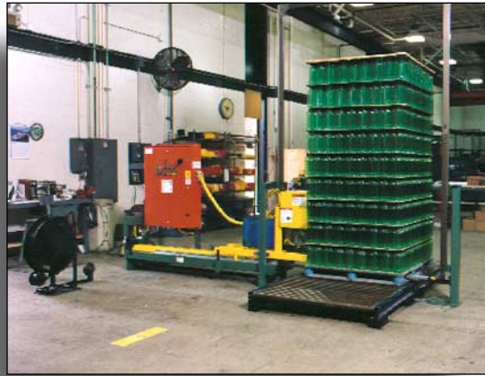
Standard BCU-3 without compression

Mounted on an indexing carriage, the MCD 510 strapping head facilitates quick retraction to the service position for maintenance. The protective covers are hinged for easy access to the service area of the head.