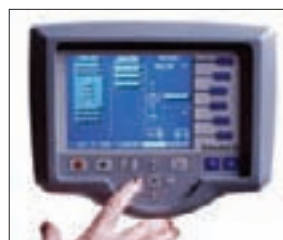
One Touch Operation

Full-color, user-friendly control panel.