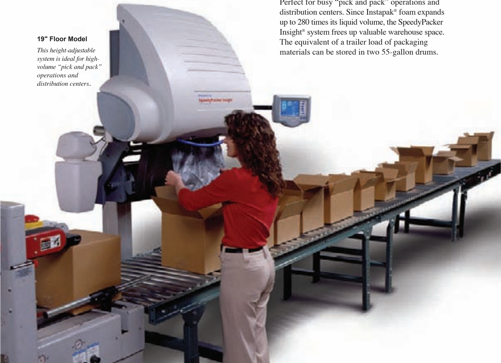
Office Supply Products

Perfect for busy "pick and pack" operations and distribution centers. Since Instapak® foam expands up to 280 times its liquid volume, the SpeedyPacker Insight® system frees up valuable warehouse space. The equivalent of a trailer load of packaging materials can be stored in two 55-gallon drums.