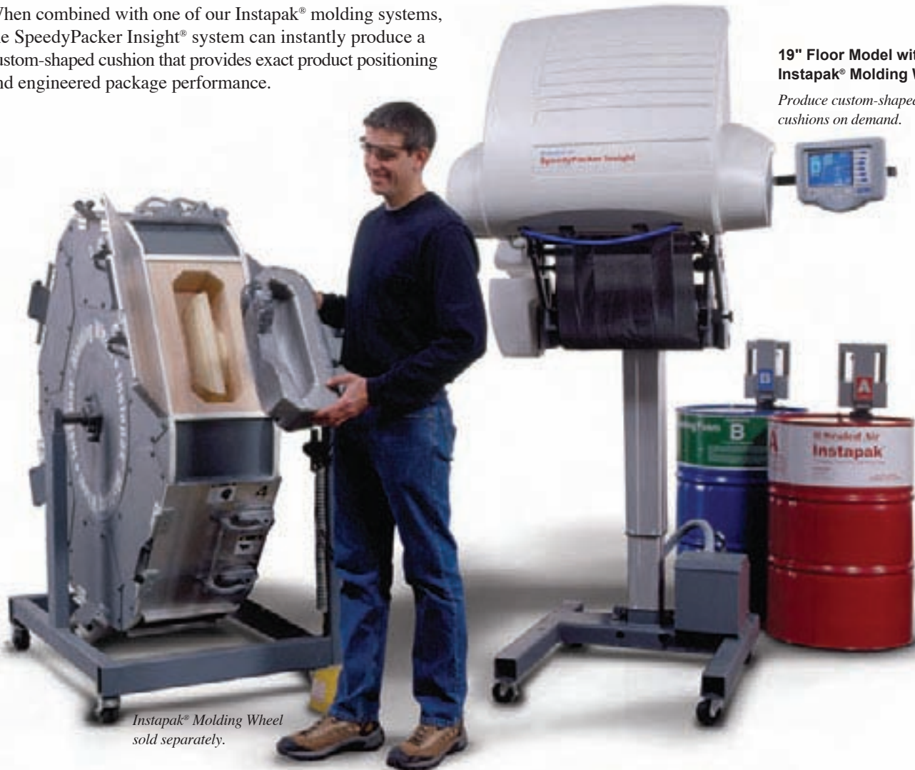
Instapak® Molding Wheel sold separately.

19" Floor Model with Instapak® Molding Wheel Produce custom-shaped molded cushions on demand.