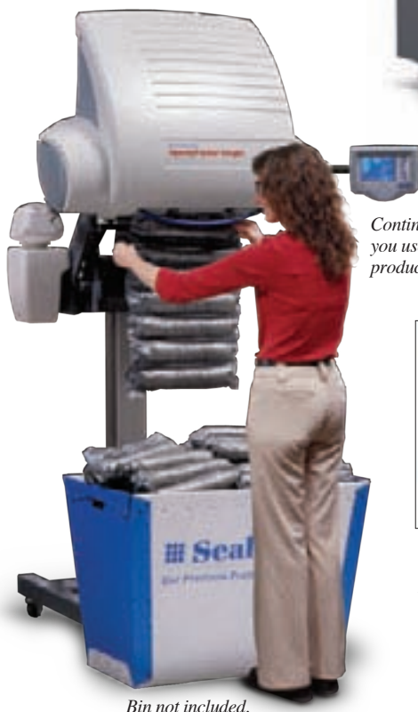
Bin not included.

Flexible Continuous Foam Tubes (CFTs) can be used to provide a base cushion or full wrap around. Insert blank film spaces between tubes to provide Instapak® protection only where needed.