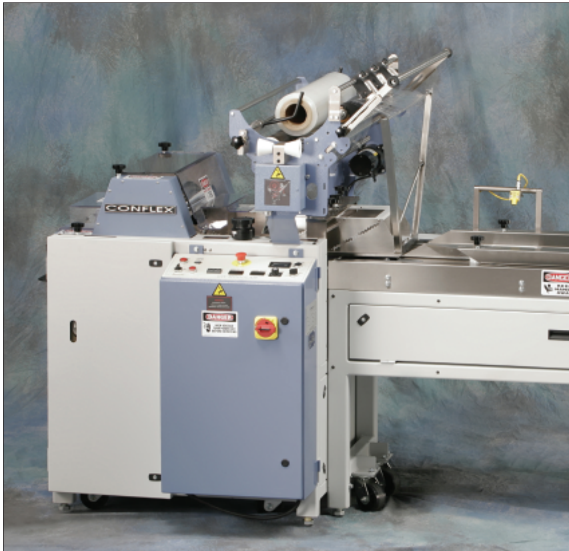
CW-160 modular shown

Efficient, Reliable, Flexible. Capable of Processing Up to 200 Packages Per Minute!