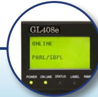
Large LCD Display Panel