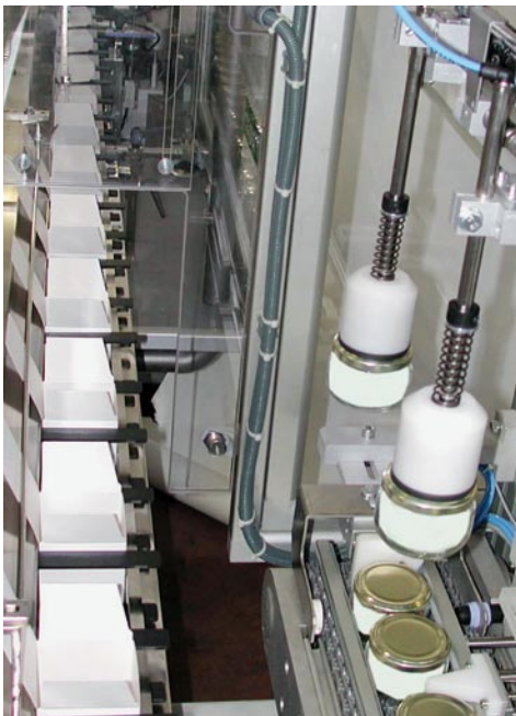
Vial feeding in intermittent mode