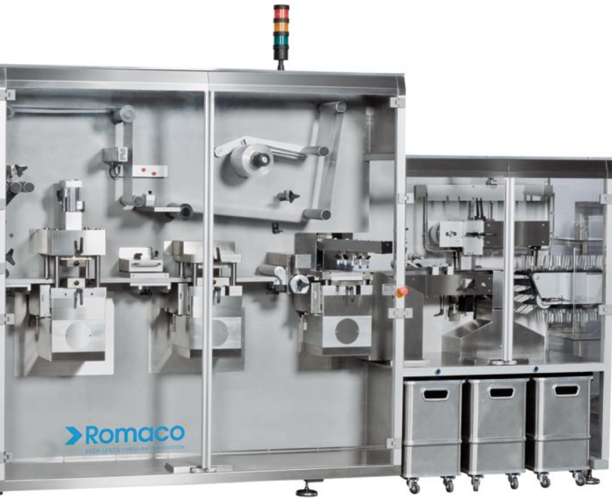
Servo driven work stations