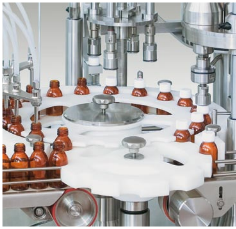
Transport system by starwheels