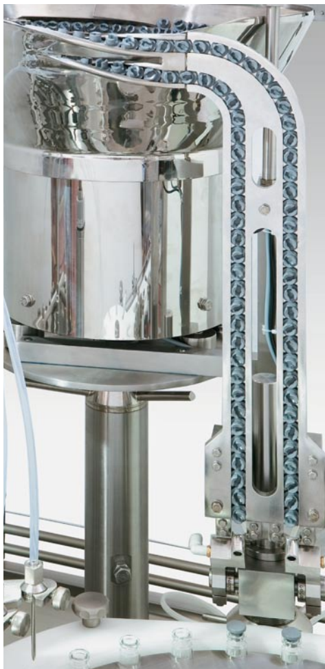
Rubber stopper unit