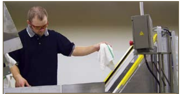
The system inspection table makes sorting towels convenient. - table top measures 48" from the floor.