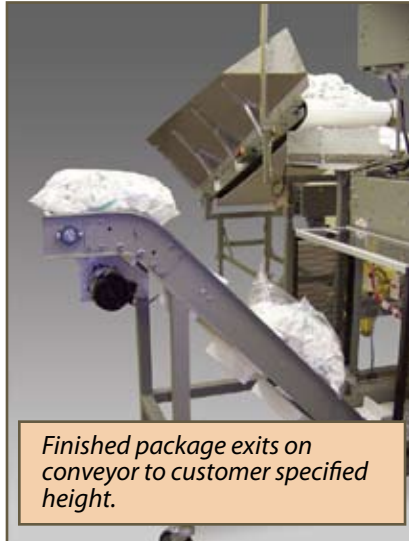
Finished package exits on conveyor to customer specified height.

the bag. The operator continues to load the next group of towels at the time the machine is cycling. This system offers ease of loading and increases production speed over current systems being used.