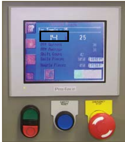
Above: Interface panel shows correct product count. Right: An ergonomically friendly platform raises the operator 20" from the floor.