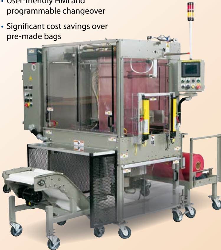
Standard Seal Assembly Horizontal Seal Above Vertical Seal