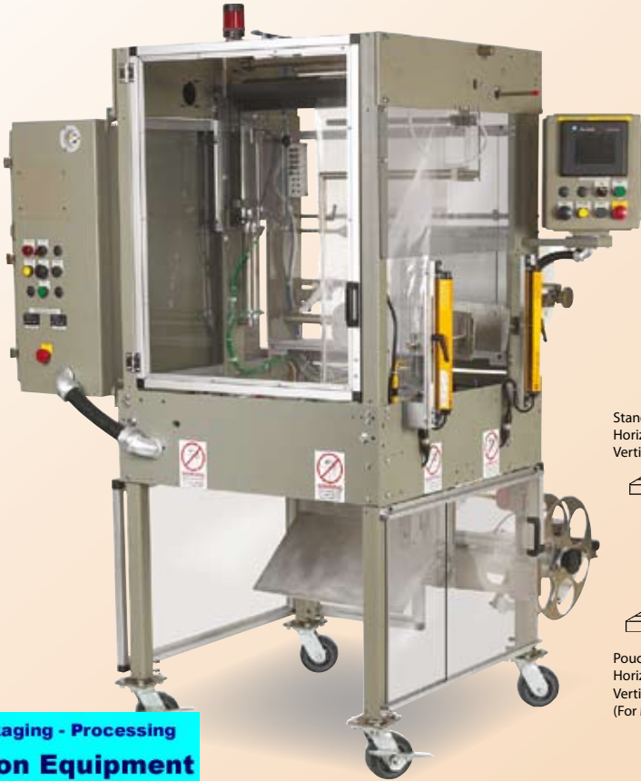
Standard Seal Assembly Horizontal Seal Above Vertical Seal