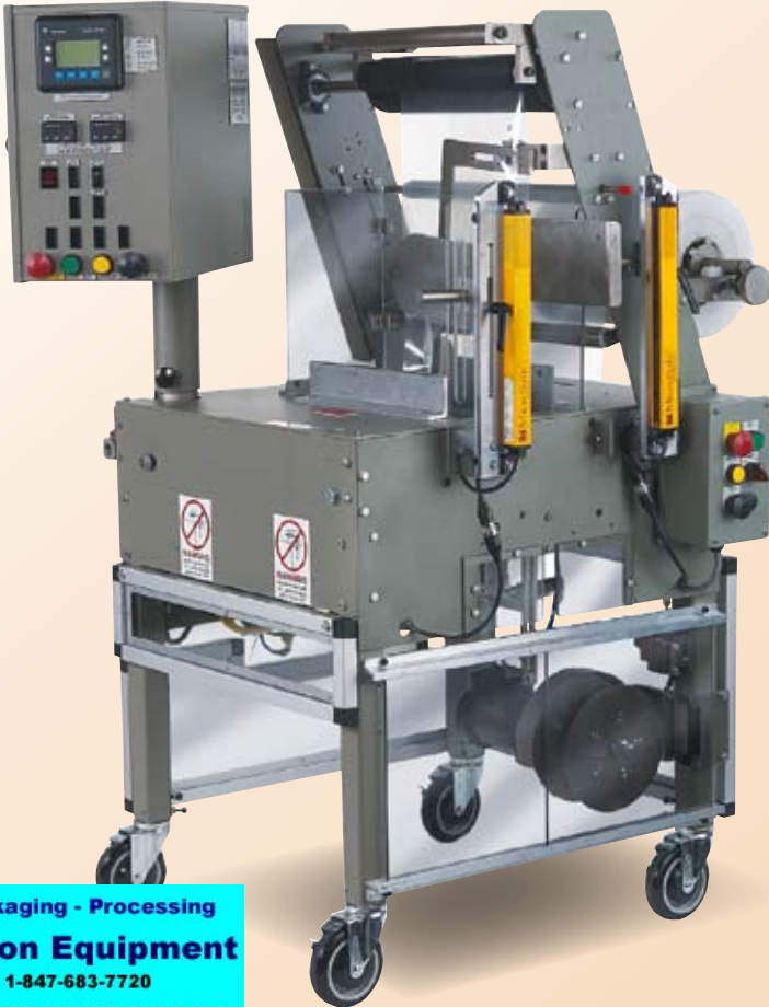
Standard Seal Assembly Horizontal Seal Above Vertical Seal