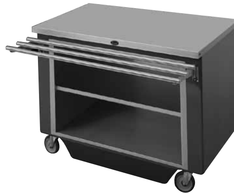
model RANFG ST-4S shown with optional kick plate and tubular trayslide