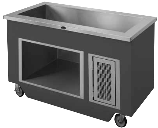
model RANFG IC-6S shown with optional kick plate