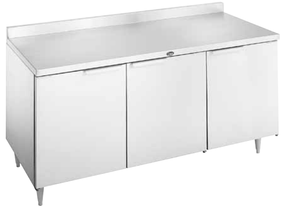
model 9604-7 shown

REFRIGERATION: CFC free, R-134a back-mounted refrigeration system to be self-contained with evaporator blower coil, compressor, thermostatic control, forced-air condensing coil and capillary tube contained in removable assembly. Condensate evaporator provided. Freezer utilizes CFC free, R-404a refrigerant, and automatic, self-defrosting system for blower coil. Units totally prewired and to be supplied with 8' cordset (NEMA 5-15P) for 115V operation. "Front Breathing" refrigeration system, requires no side or back clearance. Integrated rubber bumpers provide 1" rear clearance on models 9802F-7 and 9302F-7.