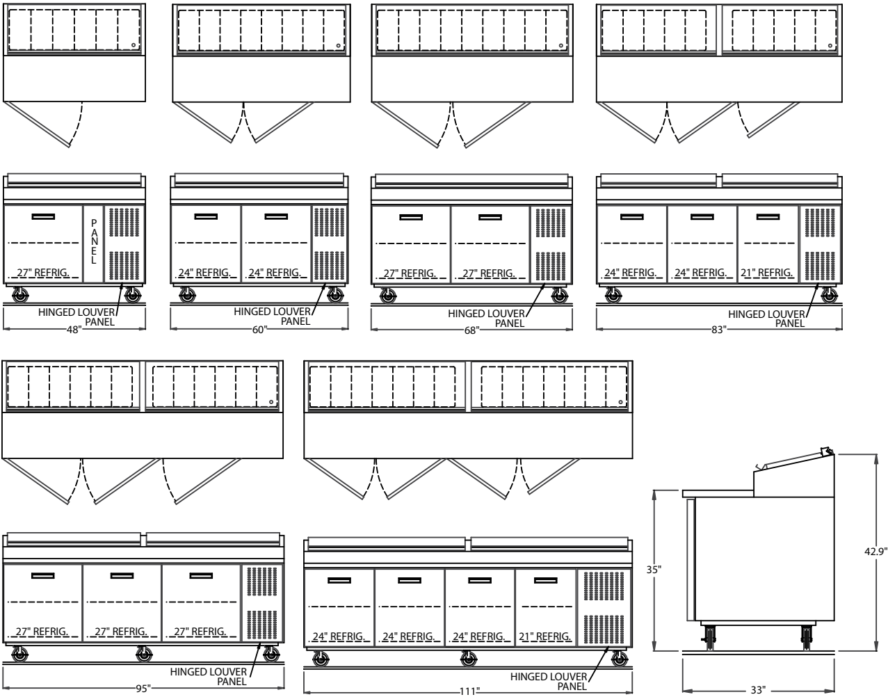
Drawings are to be viewed in the same order as the chart, one drawing to represent refrigerator and freezer units