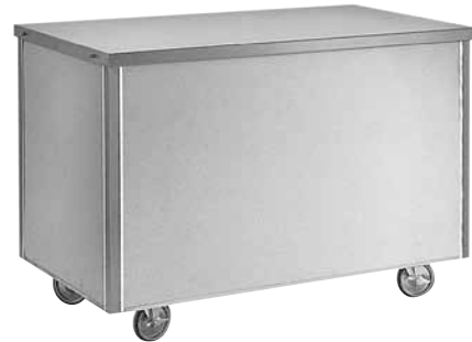
model 14G ST-4S Open Base shown