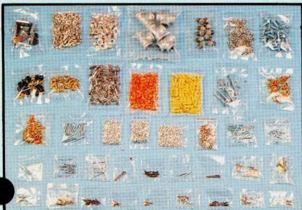
Examples of packaged materials