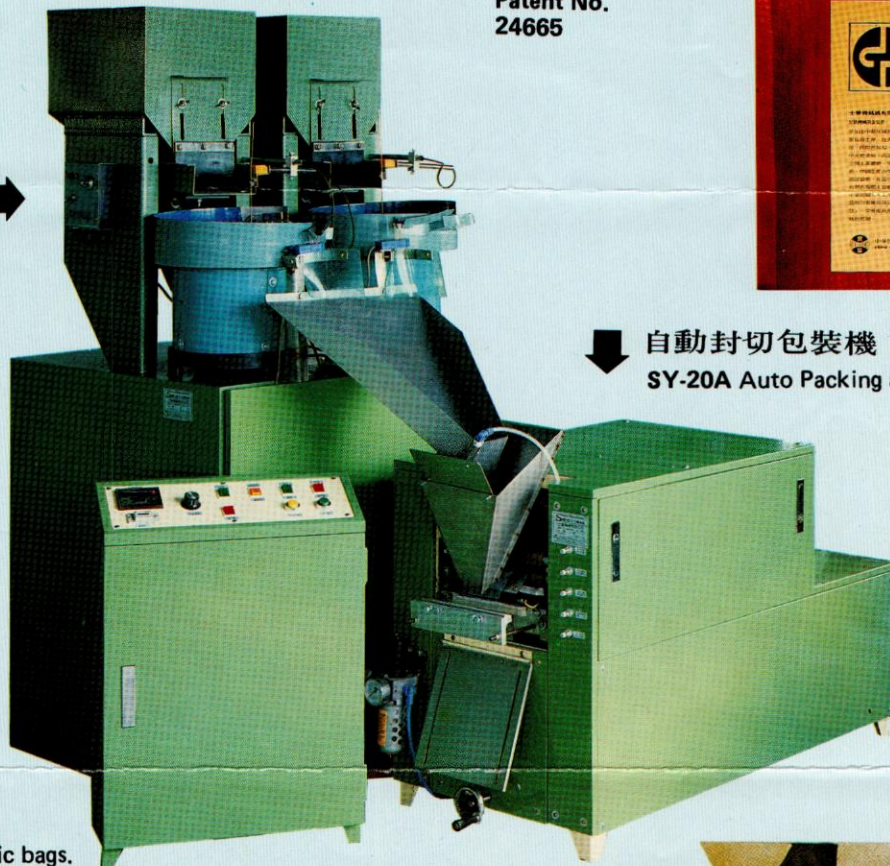
自動封切包裝機 SY-20A Auto Packing and Sealing Machine