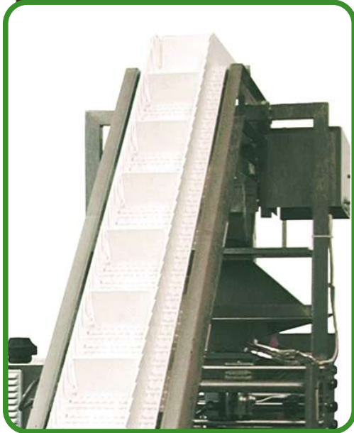
Loading conveyor belt with interchangeable pushers.

Packaging - Processing Bid on Equipment 1-847-683-7720 www.bid-on-equipment.com