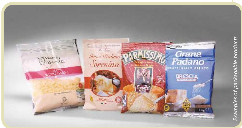
Examples of packagable products

POLAR: a special microprocessor controls all functions and makes the use of the machine simple and fast