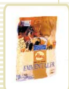
Examples of packageable products