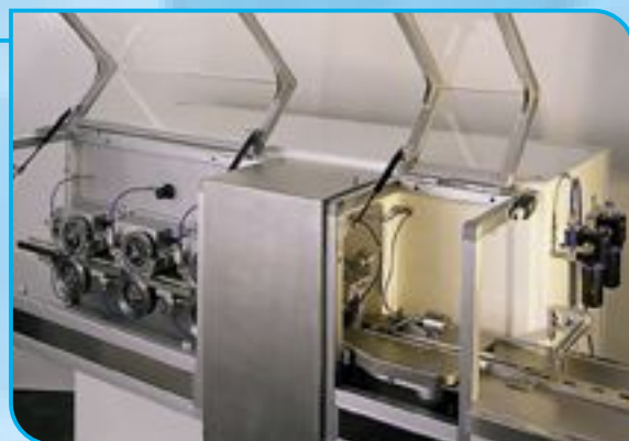
Detail of the Cutter, (PFM Patent).