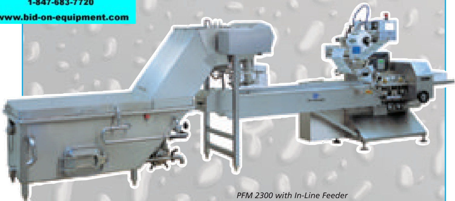
PFM 2300 with In-Line Feeder