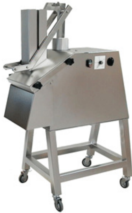
FC-330 with cheese feeder for loaves up to 4.5" x 5" x 12" in size

Voltage: 208-240V, 60 Hz, 3-phase, 20 Amp Size: L= 40" W= 22" H= 52" Shipping Weight: 300 lb (approx)