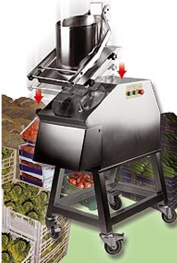
FC-330 with 13" diameter universal feeder

The FC-330 Magnum is a universal, high volume food preparation machine used in processing plants and in high volume commercial and institutional kitchens.