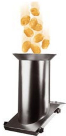
Bulk hopper for continuous feeding of potatoes, onions, tomatoes, etc...