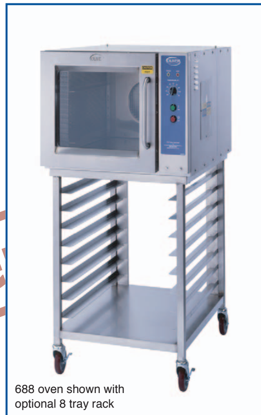
688 oven shown with optional 8 tray rack

The information contained herein is correct to the best of our knowledge. The recommendations or suggestions are made without guarantee or representation as to results. Freedom from any patent owned by Oliver Packaging and Equipment or other is not to be inferred.