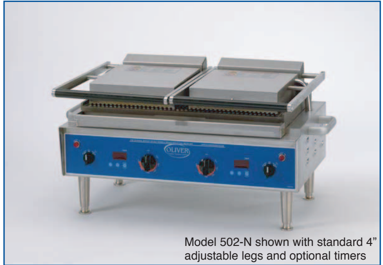
Model 502-N shown with standard 4" adjustable legs and optional timers